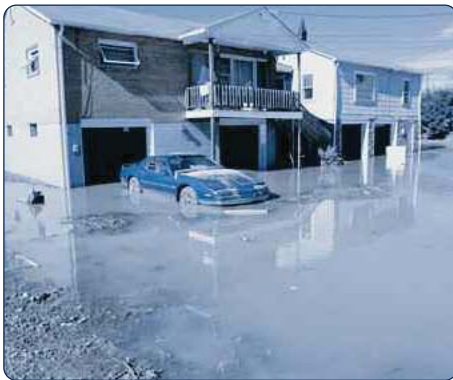
Flooding. Canton, NC, September 18, 2004 – Photo by Leif Skoogfors/FEMA Photo.

If your household uses a typical septic system, heavy rains and floods can halt its ability to treat wastewater from your home. When rainwater or flood waters pond over the drainfield, there is no place for wastewater from the household plumbing to drain because the drainfield and soil beneath are saturated, and your entire system can fail.